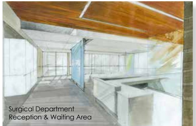
Surgical Department Reception & Waiting Area