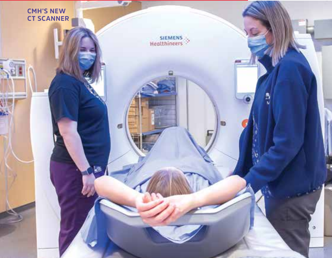
CMH'S NEW CT SCANNER

Diagnostic Imaging produces about 100,000 images per year. That's an average of 274 images each day!